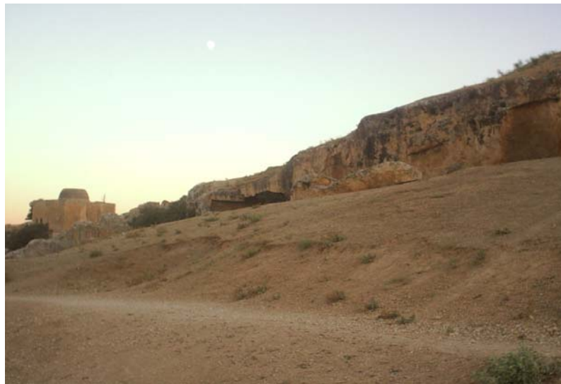
Figure 3. General view of the new locality, neighboring a human settlement, recorded for H. turcicus in Sanliurfa.