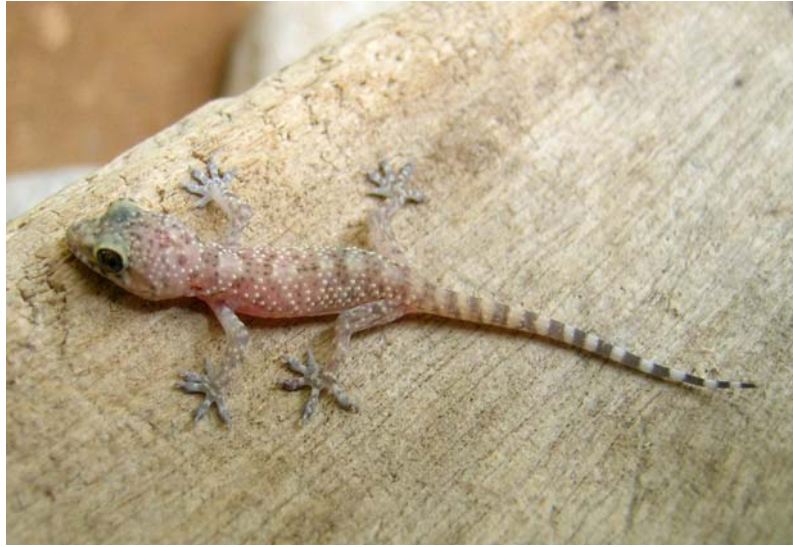
Figure 2: Dorsolateral view of H. turcicus from Sanliurfa