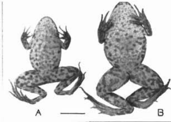
Figure 2. Ventral (A, B) pattern types of the specimens of Rana ridibunda from Yağmapınar (Karapınar-Konya) [(Horizontal bar 20 milimeters)-♀ ♀]