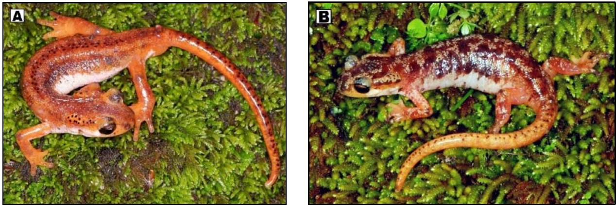
Fig 1. A: Male Lyciasalamandra billae ; B: Female Lyciasalamandra luschani basoglui .

tributed on the back and ordered regularly, forming two light dorsolateral bands. The parotoids are light yellow-salmon (Fig. 1A). The dorsal part of body in L. luschani basoglui is light yellowish-pink covered with randomly distributed brown spots of different sizes and brightness. The parotoids are lighter than the dorsal part of body. Both the extremities and tail are reddish with very small black spots (Fig. 1B). Sexual dimorphism for all Lyciasalamandra taxa is swollen cloacal region and hedonic protuberance above the tail base in males (Göçmen & Akman 2012).